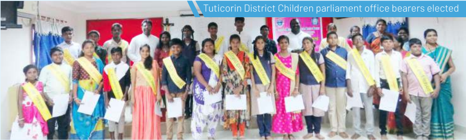
Tuticorin District Children parliament office bearers elected